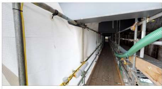
Explore M5 Oldbury Bent Walkthrough in 3D Matterport 3D Showcase