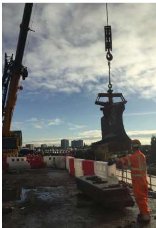
Lifting out parapet section