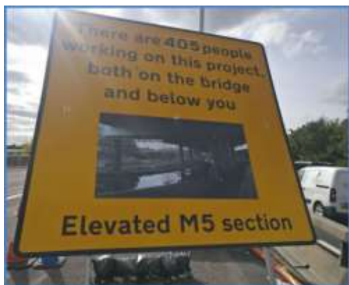
New signage in place

You can now find us on Facebook, search for M5 junction 1 to 2 Oldbury viaduct